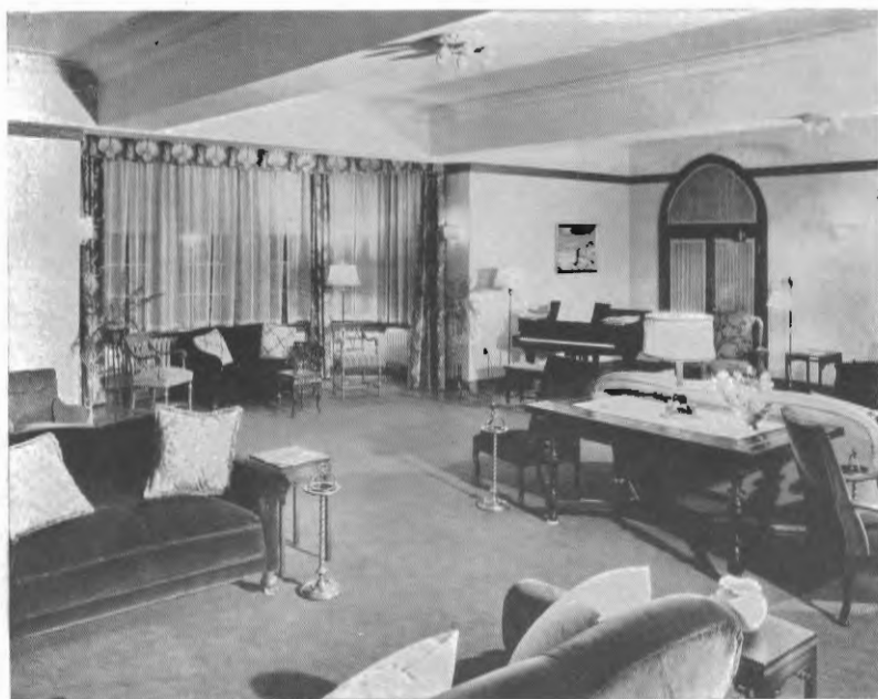
A LIVING ROOM IN ONE OF THE DORMITORIES