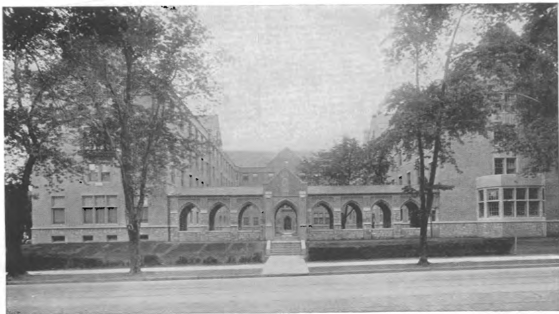
EASTMAN SCHOOL OF MUSIC DORMITORIES